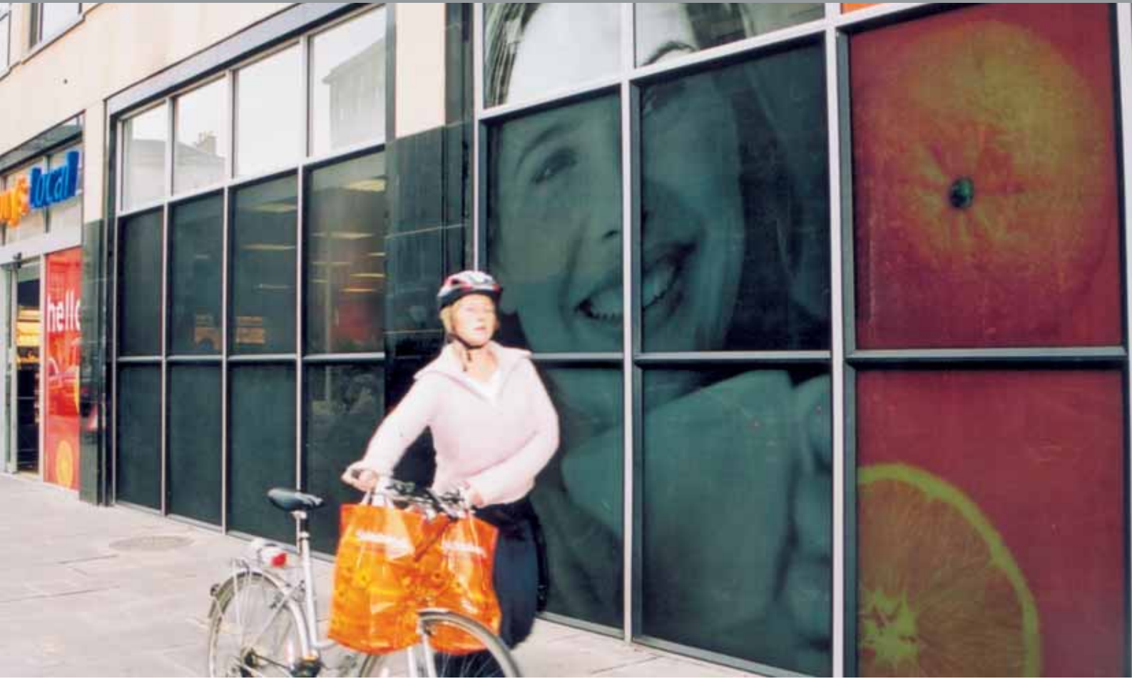
GriffinGuard allows store graphics to be seen from behind the glass whilst still protecting it from damage.