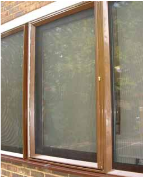
The hinge-away option allows the glass to be cleaned and offers an alternative fire escape.